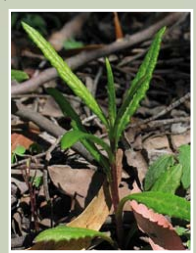
Native: fireweed groundsel