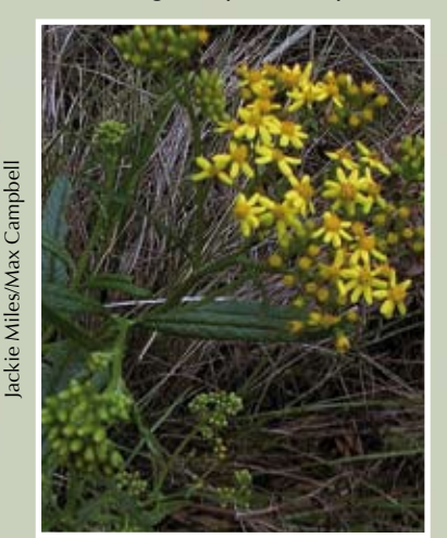
Native: fireweed groundsel