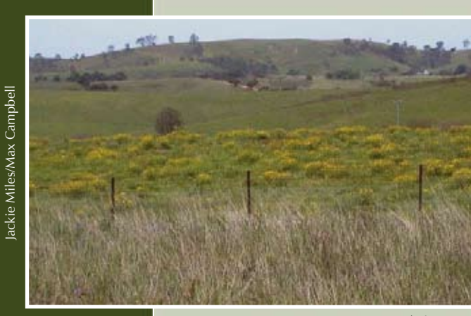
Weed: fireweed. Note the difference in fireweed numbers between the densely grassed road verge in the foreground and the grazed paddock over the fence.