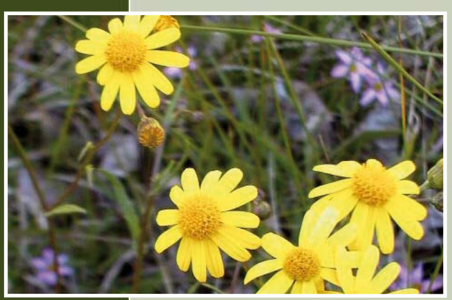
Weed: fireweed Note the 13 'petals'