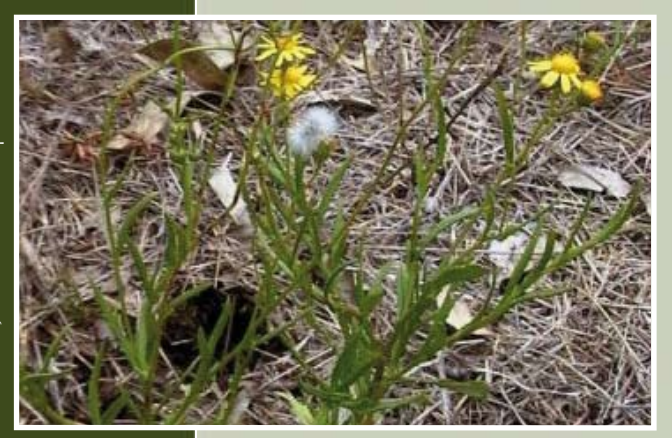
Weed: fireweed Note the 'dandelion' style seed heads