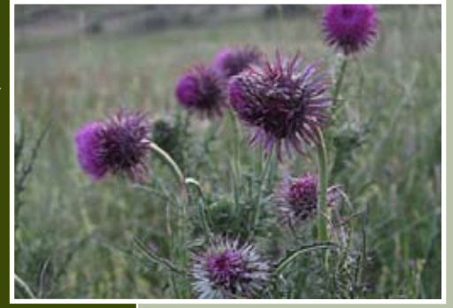
Weed: Illyrian thistle Bracts point backwards after flowering