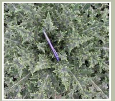
Weed: Illyrian thistle