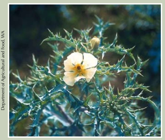
Weed: Mexican poppy