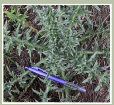
Weed: nodding thistle Note the deeply lobed leaves