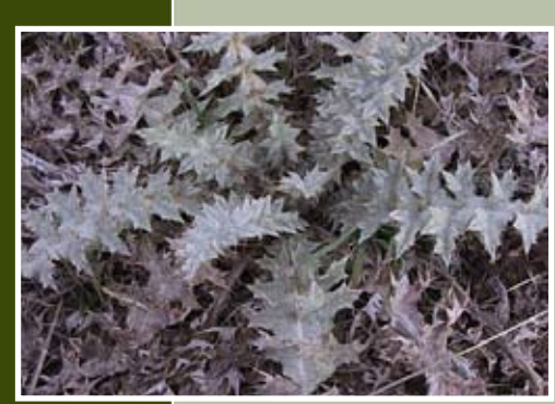
Weed: Scotch thistle