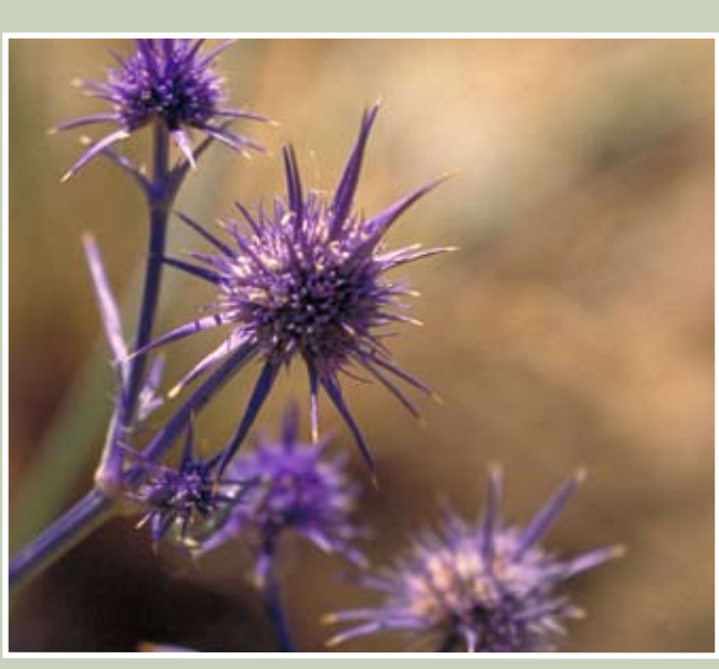
Native: blue devil

There are a number of other similar plants, some of which are natives and should not be removed and some of which are also weeds. Blue devil is a similar native species but can be differentiated by its blue flowers and the lack of spines on its grey-green or silvery leaves. Two similar weeds that should be controlled are Mexican poppy ( Argemone ochroleuca ) and wild teazel ( Dipsacus fullonum ).