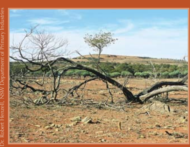
Rangeland degradation due to goats and rabbits